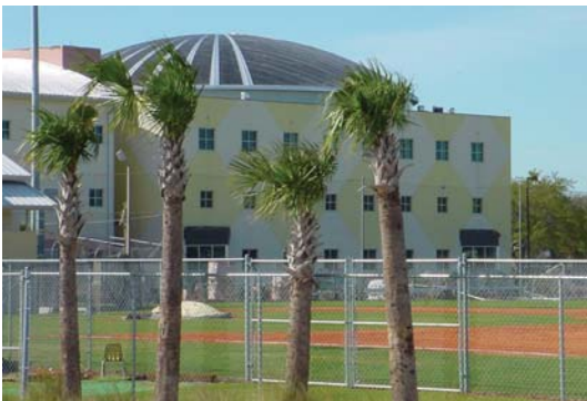
TAMPA PREPARATORY SCHOOL