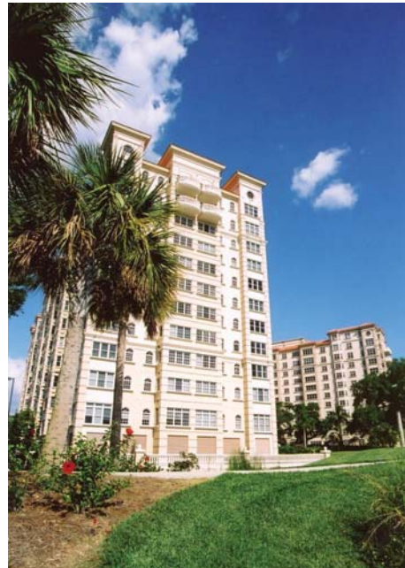
SARASOTA BAY CLUB CONDOMINIUM